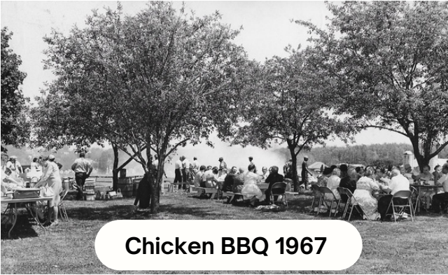
Chicken BBQ 1967

As we wrap up our 120th celebration, we are honored to have a caring community that has spread joy in Blair County for over a century. From holidays to fundraisers, we've been here for it all. What are some of your favorite VMC moments?